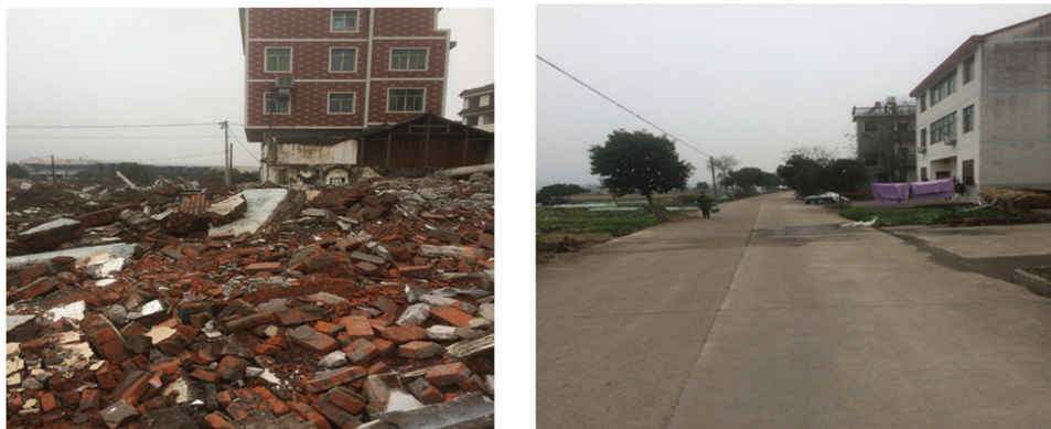
Fig. 1. The landscape of Chinese rural homesteads (Pictures taken by the first author).

The Chinese government promotes RHT, which is regarded as the capitalization of the village land resource, with the aims of developing land intensive efficiency and achieving the property income (Benham & Benham, 1998). The previous homesteads are taken back by the collective economic organization, redeveloped and exploited. The compensation and resettlement, which result in