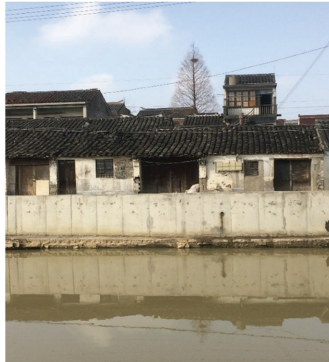
Fig. 3. The appearance of housing before RHT.