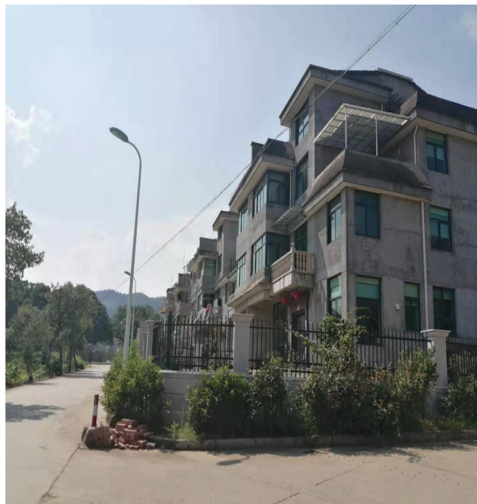
Fig. 6. The village appearance after RHT.

leaved the single-family housing style, as well as the traditional village courtyard housing (see pictures 5 and 6), that is to say, the rural residents have farewell with the old rural style and have adapted to the new community life. The use of courtyard economics to afford daily life has finished for rural residents, they have to build food and fuel. However, since the building of modern community, the culture and education facilities as well as the transportation conditions have improved, with an impact of the household perception of living standard.