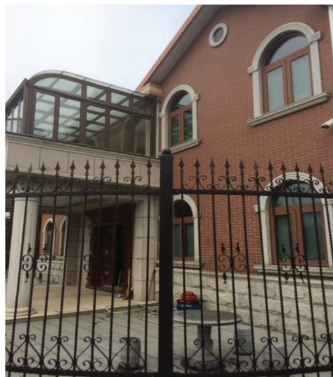
Fig. 4. The appearance of apartments after RHT.